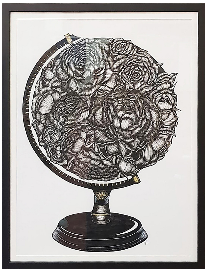
Award winning 'Beautiful World' at the West Otago Taste of Art exhibition'

She is currently working on a couple of collaborations, one being in fashion which she is very excited about. "I have a few commissions on the go and listing artwork and available prints on my website www.michaelajaneart.com and working on planning my next solo exhibition."