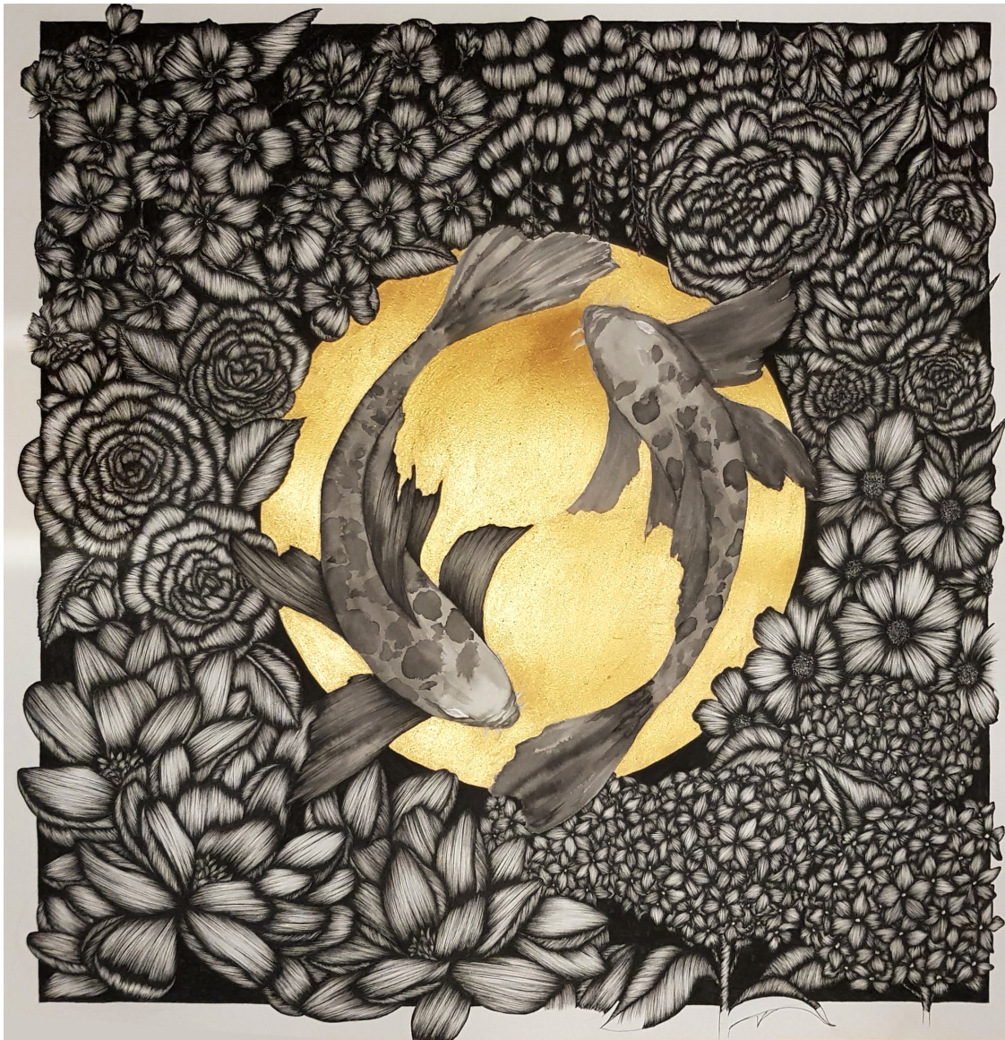
'Land of the Rising Sun' - work in progress, Japanese inspired - 500 x 500mm. Ink pens, gold leaf and paint

" I did focus a lot on the digital side whilst studying but my favourite class, looking back, was definitely life drawing. Since graduating I have mostly been a full time Graphic Designer putting work into the odd exhibition but in the last couple of years I have really started pursuing my love of drawing again in particular flowers and botanicals."