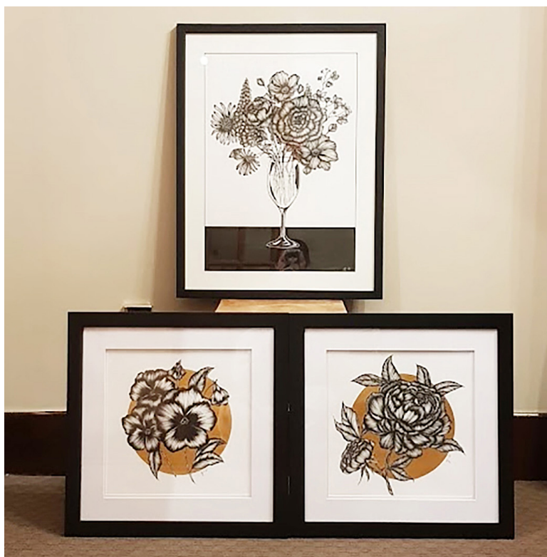
'Glass of Blooms' - ink pen indian ink. 'Golden Pansies' and 'Golden Peonies' - ink pen gold paint