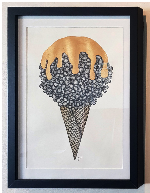
'Manuka Ice-Cream' - 250 x 400mm. Ink pen and gold paint