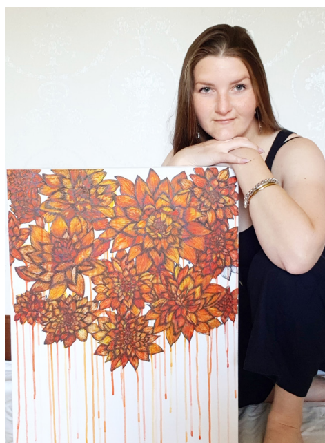
TOP: 'Loves Crossover' - 850 x 850mm. Acrylic paint and posca pens on canvas