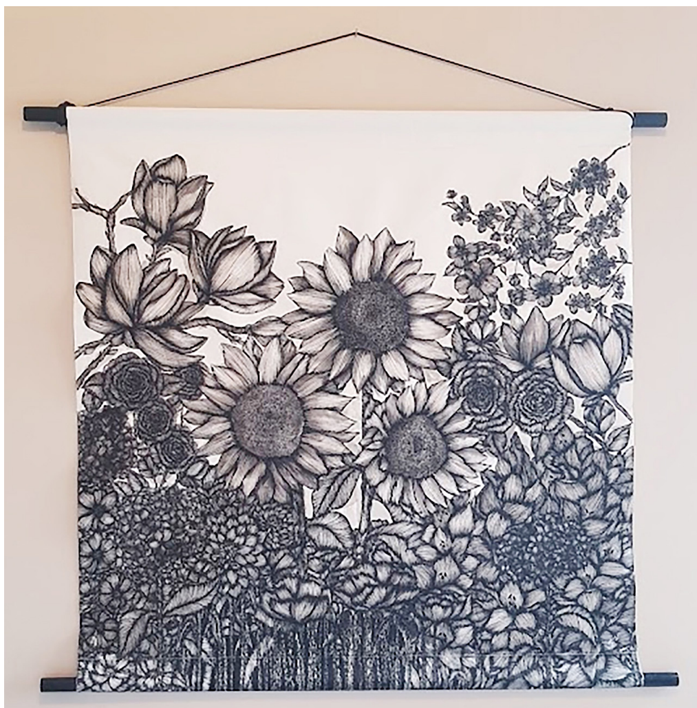
'Blooms of Growth' - 1200 x 1200mm. Indian ink wash and posca pens on canvas

When it comes to artists that she admires, her preference is not necessarily to her own style. "I love Pop Art artists like Banksy and New Zealand Artist Dick